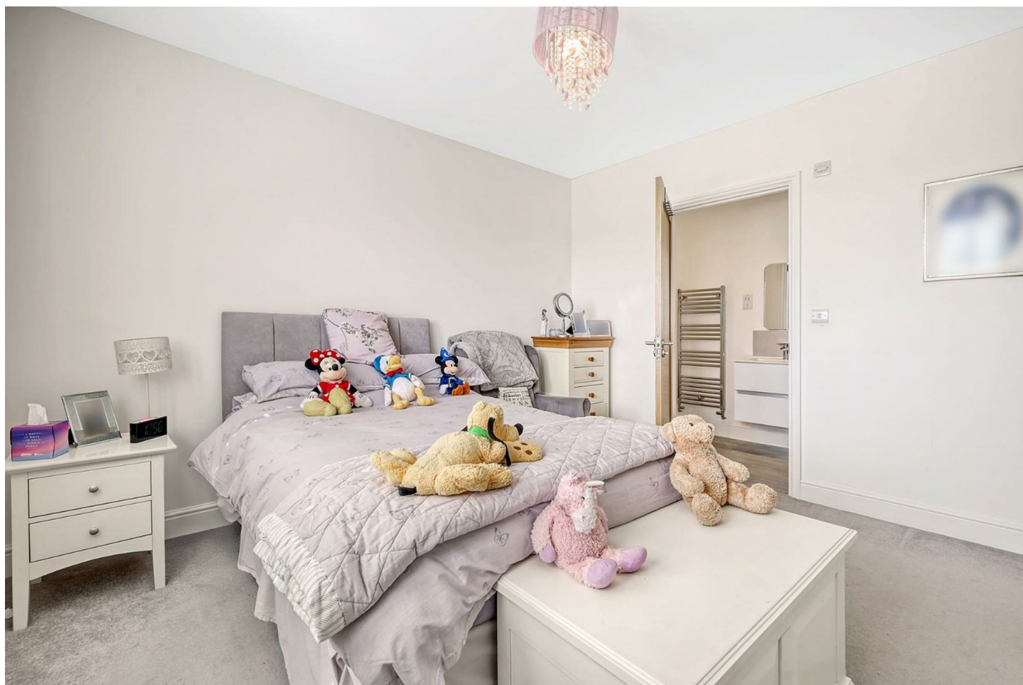
Bedroom Two 12'5" x 11'6" (3.79 x 3.52) Window to rear aspect.